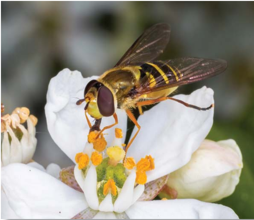
Common Flower Fly Sara Courtneidge