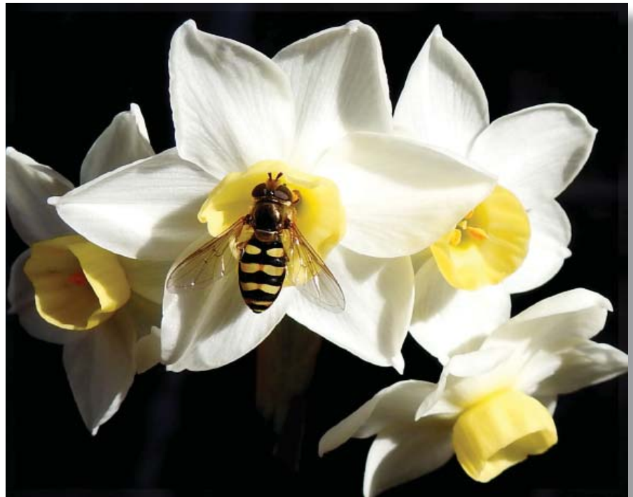
Mini Daffodils & Eupeodeles corollae, female (Fabricius, 1794) Clarissa Conn