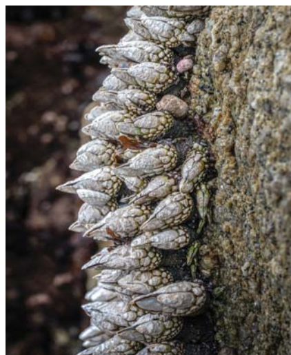
02 - Barnacles at Low Tide.jpg