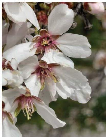
01 - Almond Tree Blossoms.jpg