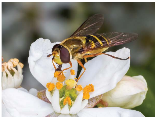
02-Common flower fly (Syrphus ribesii).jpg