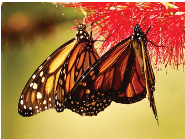
12 - Monarchs PG-2.jpg