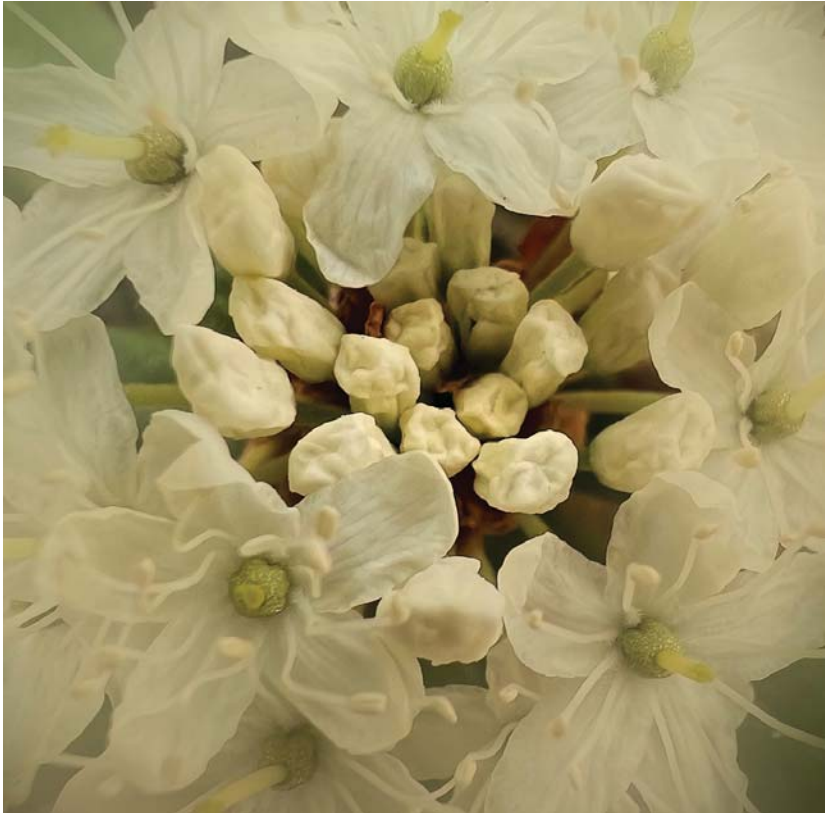
Inside a Giant Scabious- Cephalaria leucantha