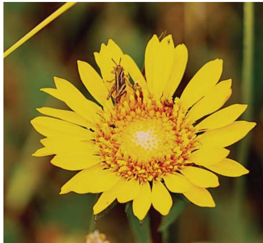
11 - Gum Plant and a Grass Hopper.jpg