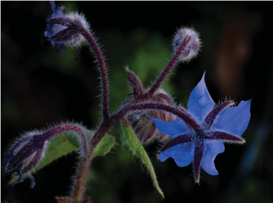
Blue Flower with Friends Chritina Parson