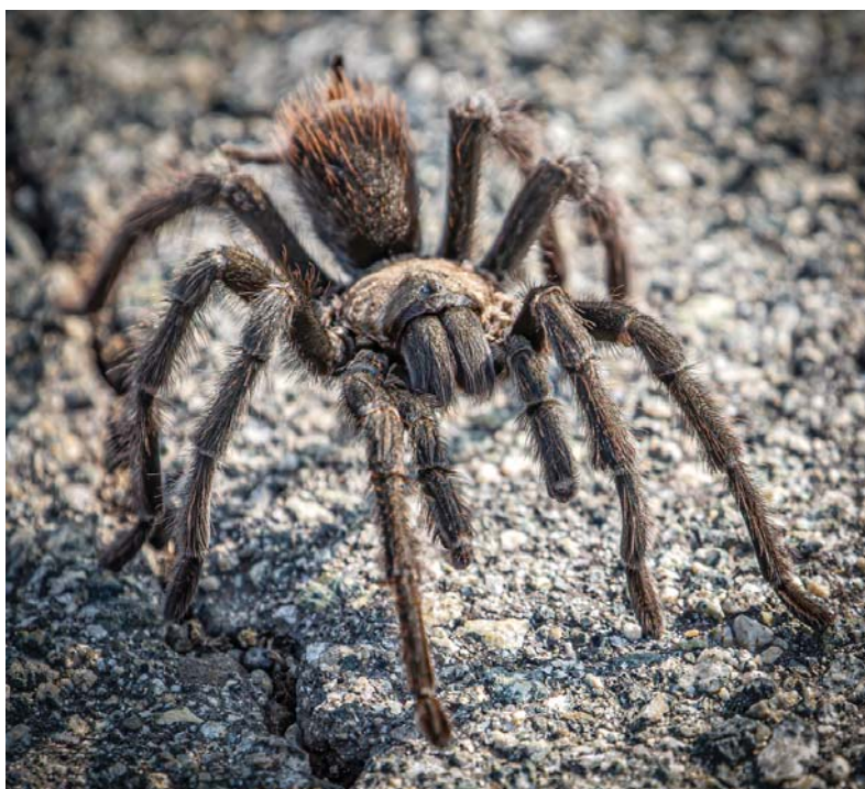
Tarantula (Aphonopelma Chaleodes)