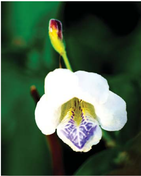
10 - Wildflower, Kona, Hawaii.jpg