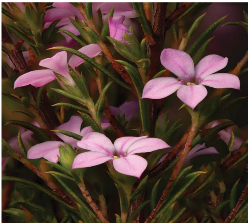
Pretty in Pink Charlie Gibson