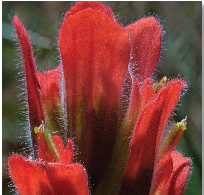
Coast Paintbrush Brooks Leffler